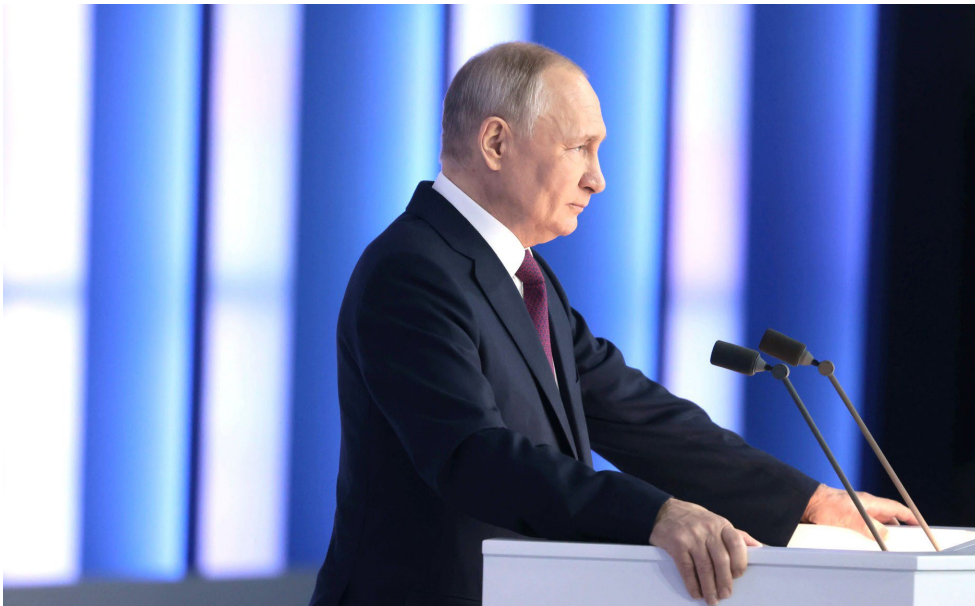
Vladimir Putin delivers his address to the Federal Assembly in Gostiny Dvor, Moscow, 21 February 2023

Viewed from Western capitals, Russian President Vladimir Putin's invasion of Ukraine is the most consequential event in world affairs since the fall of the Soviet Union in December 1991. On its outcome hang the survival of Ukraine as a sovereign state, the future of European security, the credibility of the West, and the preservation of the rules-based international order.