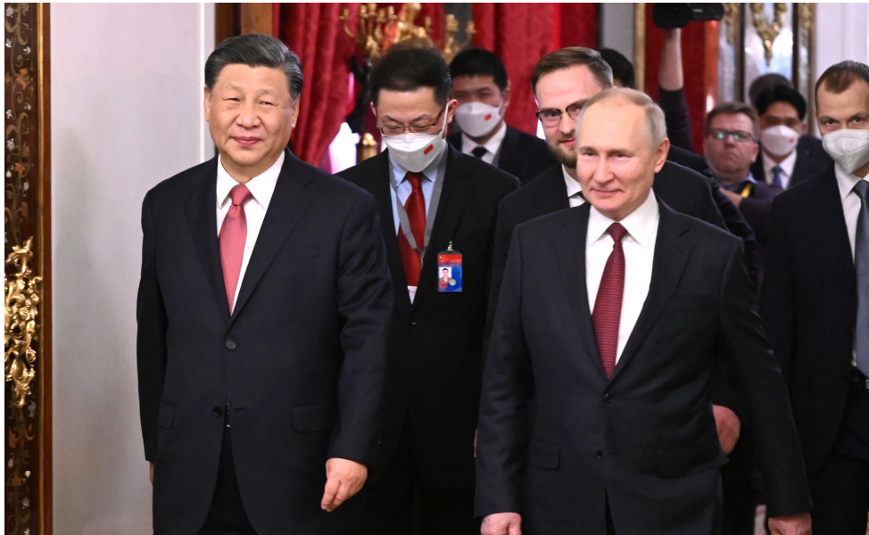
A number of European states are disappointed by Beijing's rhetorical support for Vladimir Putin. China's President Xi Jinping with Russian President Vladimir Putin before Russian-Chinese talks at the Kremlin, March 2023

The war in Ukraine has encouraged Washington to amplify the dangers posed by authoritarian powers. The message is that the differences between democracies and autocracies are not simply political or ideological but have real consequences for international security. While China may not be a direct participant in the war, its support for Russia is fuelling the conflict. It is also escalating its aggressive activities in the Indo-Pacific and is committed to overturning the rules-based international order. 33 Underpinning these assumptions is the premise that authoritarian powers, such as China and Russia, are congenitally disposed to aggressive foreign policy behaviour. 34