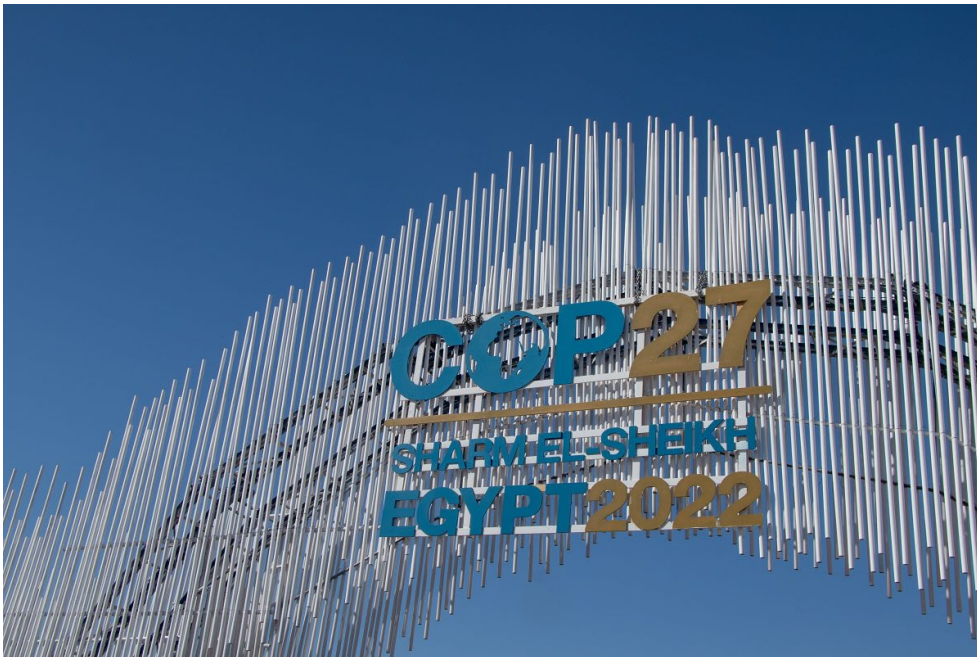
The North–South divide was brought into sharp relief at last year’s COP27 Climate Change Conference in Egypt

The war in Ukraine has accentuated the North–South divide. This is not only about relative influence and status within the international system, but also different priorities. Whereas Western leaders are preoccupied by Russia’s disruption of the European security order and by the rise of China, most of their counterparts in the Global South are focused principally on economic and developmental challenges, such as debt relief, food security, and mitigating the effects of climate change. 46 This is a major reason why Biden’s construct of democracies versus autocracies has minimal appeal beyond the West. Even in the Indo-Pacific, where there are genuine security anxieties about China, most nations are more interested in strengthening economic cooperation with their largest trading partner than in ideological point-scoring. 47