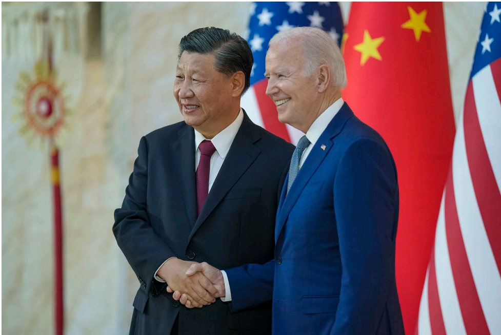
US–China strategic rivalry is now more acute than in half a century. US President Joe Biden with China’s President Xi Jinping ahead of their bilateral meeting in Bali, Indonesia, 14 November 2022

One might imagine that the Ukraine war would have taken some of the heat out of US–China strategic rivalry. Washington has had to focus primarily on events in Ukraine. The war has exposed the limits of Sino–Russian partnership (the so-called “no limits friendship”). Beijing has so far refrained from supplying Moscow with weapons 25 or helping it to bust Western sanctions. 26 And China’s President Xi Jinping has distanced himself from Putin’s nuclear blackmail, while Chinese officials routinely brief against the Kremlin. 27